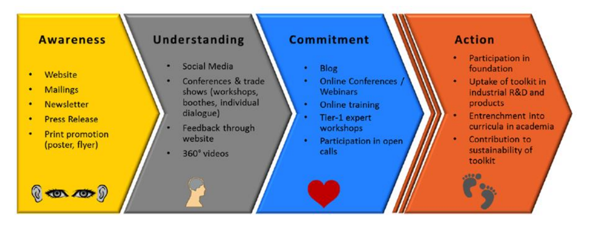
Figure 1: The four communication levels employed in RobMoSys

Throughout the entire project, the dissemination strategy will be focusing on creating commitment and attracting potential future supporters of the project and its results at four levels of communication: awareness, understanding, commitment and action (participation).